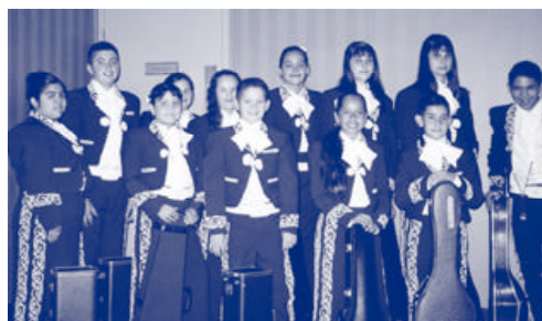
Student Mariachi Group: Armonia Ranchera